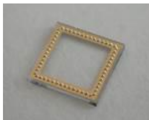
Exterior of SKe-Lid

Deep ultraviolet LEDs are a next-generation light source expected to replace mercury lamps and have various applications including water disinfection in industry and air disinfection systems in healthcare. When used in combination with quartz glass, which has high transmissivity of deep ultraviolet wavelengths, and AuSn sealant, which has excellent airtightness and durability, however, problems with cracking of the quartz glass and metallization 2 separation can occur. These glass lids, made of quartz glass with AuSn solder, employ proprietary Tanaka Kikinzoku Kogyo technologies that properly control the shape and dimensions when applying the AuSn sealant to the quartz glass, making it possible to control cracking and metallization separation. Higher yields are expected to contribute to improved productivity and lower costs.