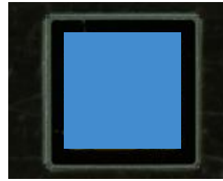
Newly Developed Ske-Lid Quartz Glass Lid with Gold-Tin (Quartz glass after gold-tin sealing has no cracks)