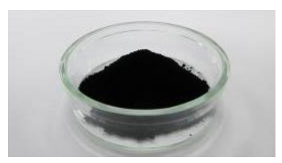
\langle A\, PEFC electrode catalyst, a product for which Tanaka Kikinzoku Kogyo boasts the world's highest shipment volume \rangle